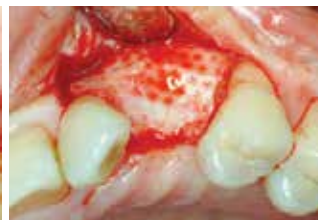
Second stage surgery