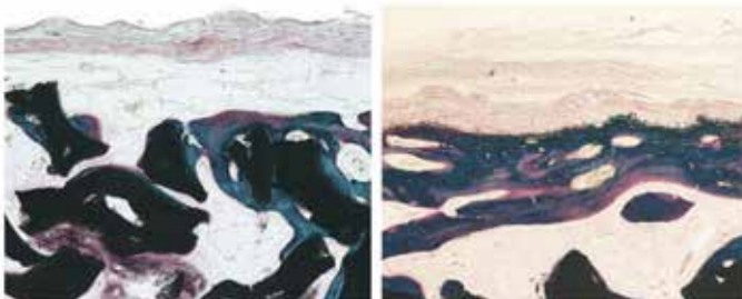
Rabbit calvaria model, 6 weeks